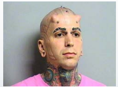
Most Outrageous Mug Shots Bad Hair Days, Costumes, and Ironic T-Shirts